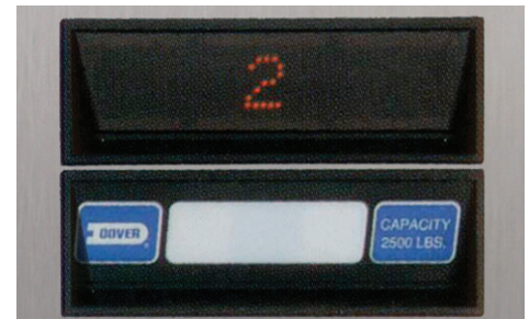
Before Impulse+ retrofit