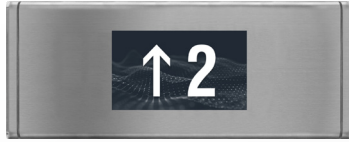
Hall Position Indicators with and without arrows. Standard and custom graphics shown.