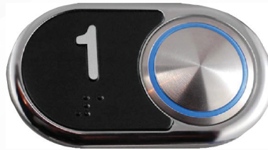
BS Classic Series pushbutton with Julius surround