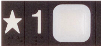
Impulse Fixture pushbutton