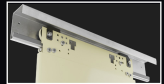
WHH HANGER KIT