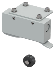
GATE SWITCH AND ROLLER