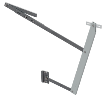
DRIVE ARM ASSEMBLY