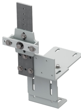
PIVOT TOWER W/ FRONT SUPPORT