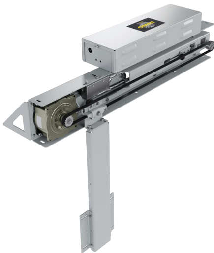
GAL MONXT - OMNI OPERATOR