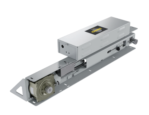
MONXT - OMNI OPERATOR