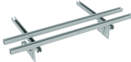
OPERATOR MOUNTING KIT