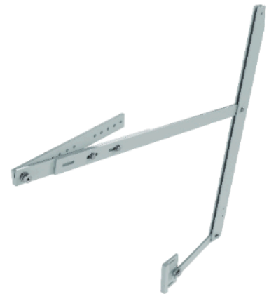
DRIVE ARM ASSEMBLY