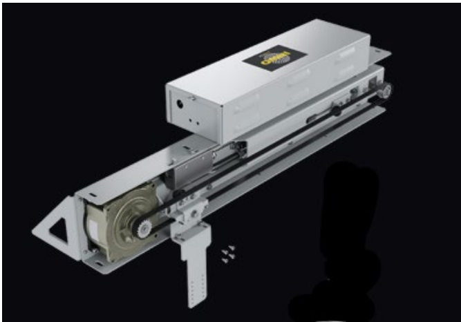
MONXT OMNI with Hanger Mount Bracket